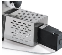
Optional variable speed pasta cutter