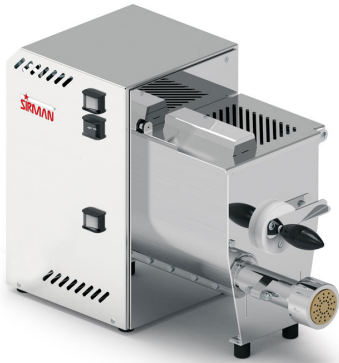
Sirman Pasta Machines , model Sinfonia 2 :

Authorized Distributor: FOODSERVICE EQUIPMENT MARKETING 10 CARRON PLACE-KELVIN IND.ESTATE G75 0YL GLASGOW() TEL./FAX. 0044-1355 244111 / 0044-1355 241471 E-mail: dohertyj@fem.co.uk