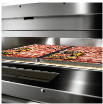
Capacity: 2 trays 60x40