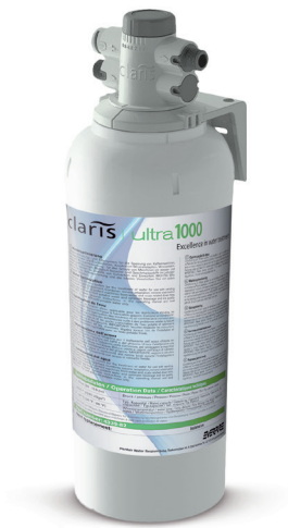
Head sold separately.

Claris Ultra 1000-L Filter Cartridge: EV4339-82