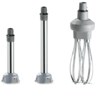
Shafts and Whisk