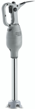
Sirman Hand Held Mixer , model Ciclone :

Authorized Distributor: FOODSERVICE EQUIPMENT MARKETING 10 CARRON PLACE-KELVIN IND.ESTATE G75 0YL GLASGOW() TEL./FAX. 0044-1355 244111 / 0044-1355 241471 E-mail:sales@fem.co.uk