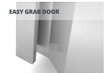
EASY GRAB DOOR