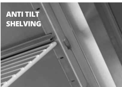
ANTI TILT SHELVING