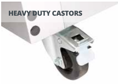
HEAVY DUTY CASTORS