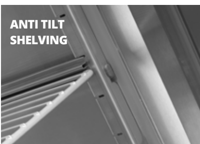
ANTI TILT SHELIVING