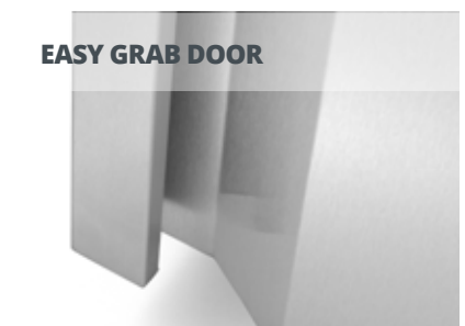
EASY GRAB DOOR