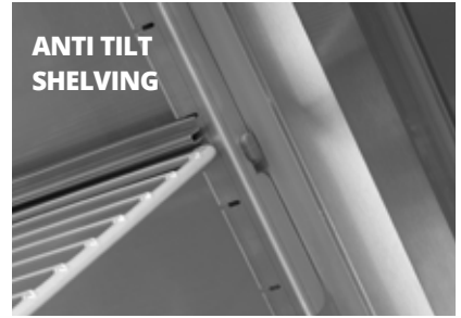
ANTI TILT SHELVING