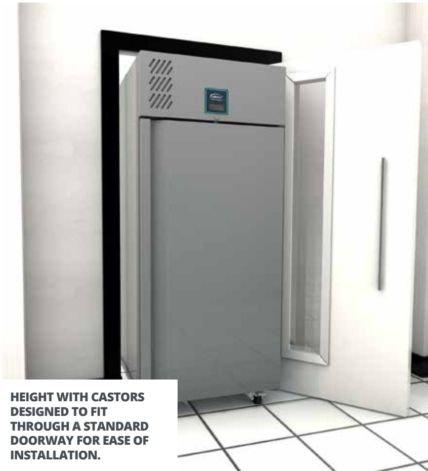
HEIGHT WITH CASTORS DESIGNED TO FIT THROUGH A STANDARD DOORWAY FOR EASE OF INSTALLATION.