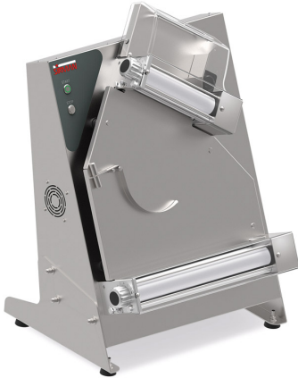
Sirman Rolling Machines , model P-roll 320/2 - 420/2 :

Authorized Distributor: FOODSERVICE EQUIPMENT MARKETING 10 CARRON PLACE-KELVIN IND.ESTATE G75 0YL GLASGOW() TEL./FAX. 0044-1355 244111 / 0044-1355 241471 E-mail:vanhentend@fem.co.uk