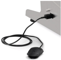
Optional pedal controls