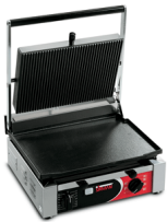
CORT L Timer