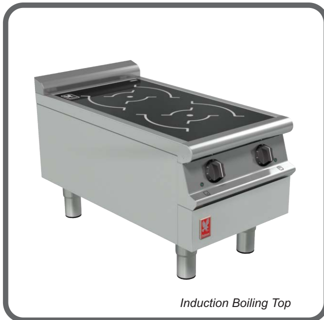
Induction Boiling Top