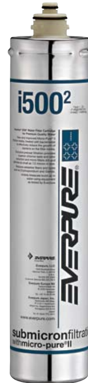
i500 Replacement Cartridge: EV9612-24

Everpure water treatment systems (excluding replaceable elements) are covered by a limited warranty against defects in material and workmanship for a period of five years after date of purchase. Everpure replaceable elements (filter cartridges and water treatment cartridges) are covered by a limited warranty against defects in material and workmanship for a period of one year after date of purchase. See printed warranty for details. Everpure will provide a copy of the warranty upon request.