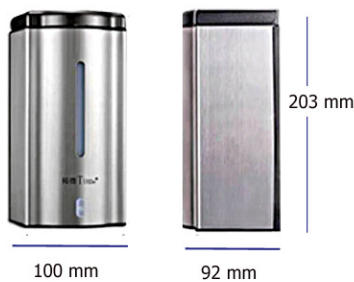
ESD: Electronic Dispenser Dimensions