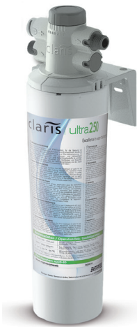
Head sold separately.

Claris Ultra 250-S Filter Cartridge: EV4339-80