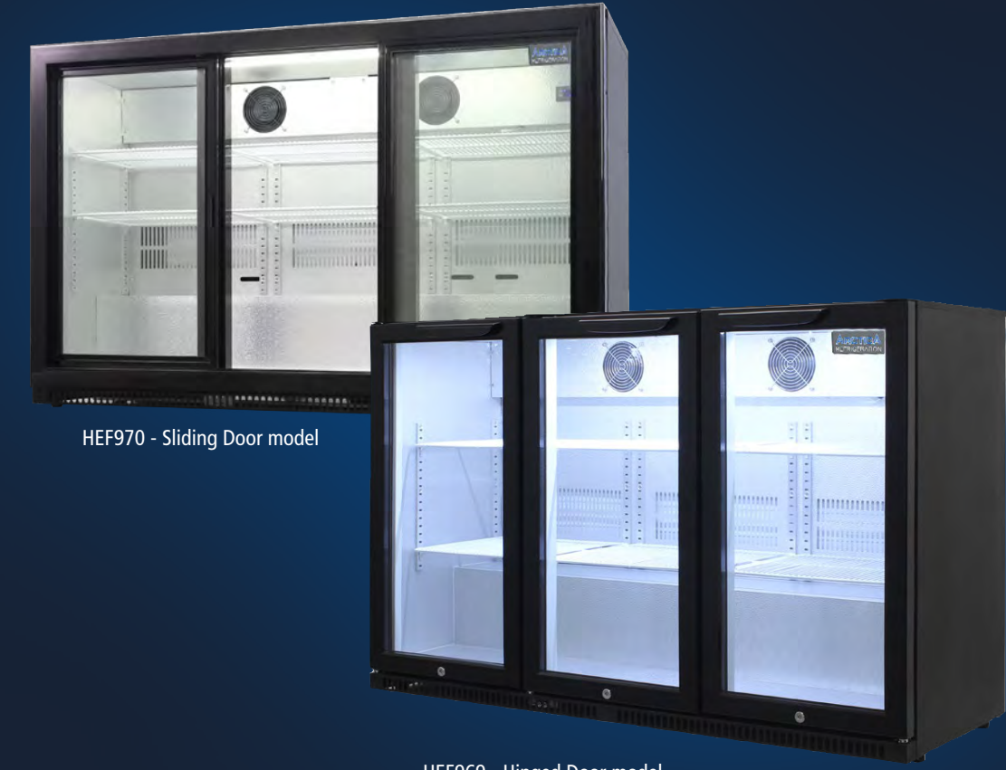
HEF969 - Hinged Door model